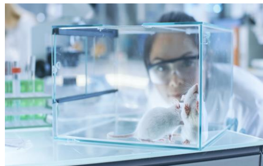
Animal Behavioral Studies